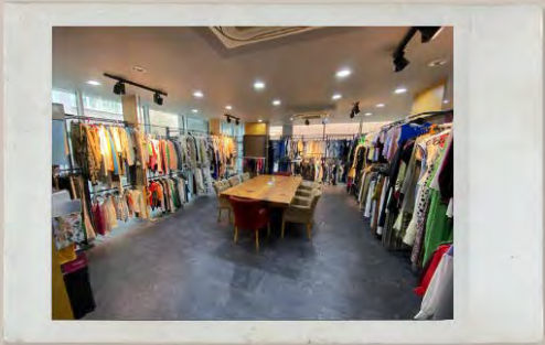
Fashion & Licence Our Showroom