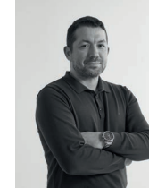
Designer: Halit ÇELİKOĞULLARI

Natural wooden armrest details add warmth and a sophisticated character to the design. Thanks to its balanced proportions, it can be used comfortably in a wide range of settings, from living rooms to relaxation corners. Messina brings together comfort and aesthetics for modern living spaces.