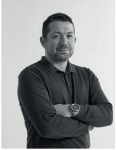
Designer: Halit ÇELİKOĞULLARI

Roma redefines comfort through its modular structure and adjustable back mechanism. Thanks to its various seating configurations, it easily adapts to different spaces and usage needs. With its balanced forms, soft texture, and modern lines, Roma offers a living space that is both aesthetic and functional.