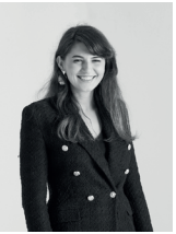
Designer: Hale Betül GÜLEÇ

Laria draws inspiration from the elegance and lightness of the tulip form. Its pure silhouette, shaped by modern lines, transforms nature's inherent grace into a contemporary language. The curved form, much like the gentle movement of a tulip petal wrapping around the stem, brings a sense of calm rhythm, while its texture evokes a serene feeling of balance. Offering a subtle delicacy hidden within simplicity, Laria conveys a balanced aesthetic sensibility and a quiet elegance in every detail.