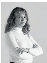
Designer: Eda TÖYER

The Marzen Bedroom brings together colors inspired by burgundy grapes and pomegranate tones, symbols of abundance in Mardin with soft, fluid forms. Marble textures and matte black metal details are balanced with rounded and oval lines, creating a calm and refined atmosphere. While the bed places comfort at the center with its headboard that offers a sense of soft embrace, the integrated bedside lamp and USB port provide an aesthetic solution to modern needs.