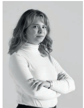
Designer: Eda TÖYER

Lalin Berjer was designed with inspiration drawn from the delicate tulip motif frequently found in the art of filigree. Its double-layered form, shaped by slender metal legs and oval curves, evokes the layered petals of a flower. With its soft lines, Lalin adds a calm aesthetic to the space and brings a traditional motif together with a contemporary interpretation. Its timeless stance offers a quiet yet powerful expression of design.